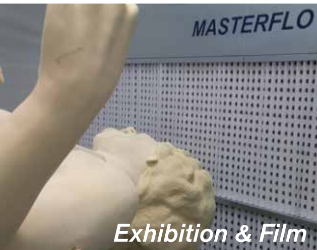
Exhibition & Film