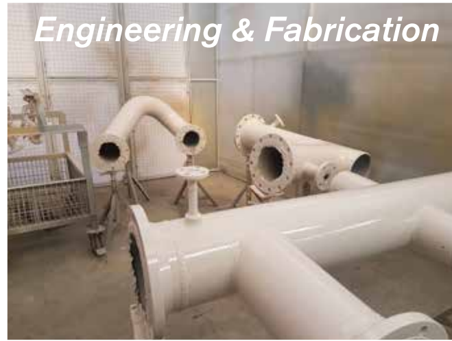
Engineering & Fabrication